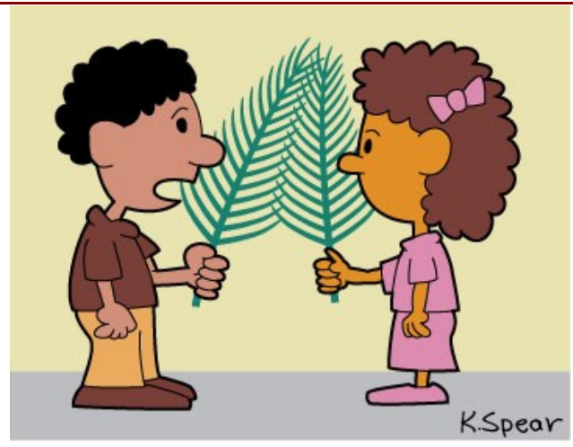
"I thought Palm Sunday was when everyone went to Florida for spring break."